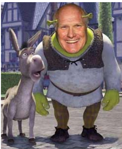
Starring Terry Bradshaw as Shrek