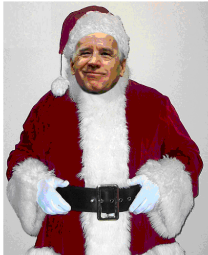
Vice Pres. Santa Joe Biden

Each SFFL season we like to provide some easy reading during the Thanksgiving holiday. Thanksgiving is synonymous with football games and Santa Claus.